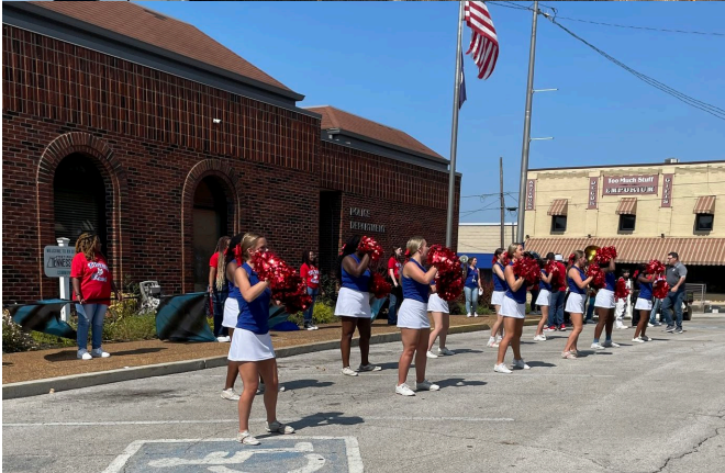
2023 Homecoming Parade in front of City Hall